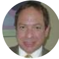
DAVID ROSE CHAIR

The BID extends from Third Avenue to Jerome Avenue along Fordham Road and also includes the commercial areas on select side streets. The district is comprised of approximately 80 buildings and almost 300 businesses ranging from nationwide chains to locally owned independent shops.